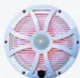
SW-W White SW