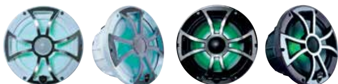
XS-W-SS White Stainless Steel XS