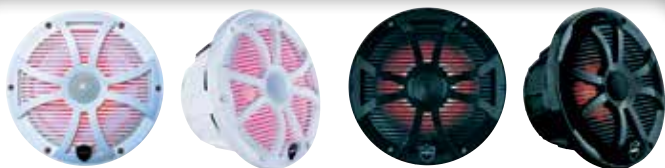
SW-W White SW

Available in 6", 8" & 10" configs. 8 different Grill options.