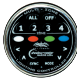
WS-4Z RGB CONTROLLER WET SOUNDS / SHADOW CASTER MULTI-ZONE RGB LIGHT CONTROLLER