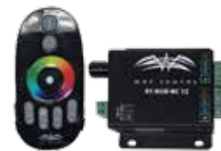
WS RF-RGB-MC V2 RF CONTROLLER W/ MUSIC ACTIVATED LIGHTING