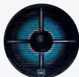
XW-B Black XW