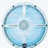
XW-W White XW