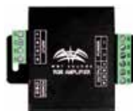
RGB AMPLIFIER RGB CONTROLLER REQUIRED

Take FULL color RGB LED control with these compatible RGB REMOTES from Wet Sounds!