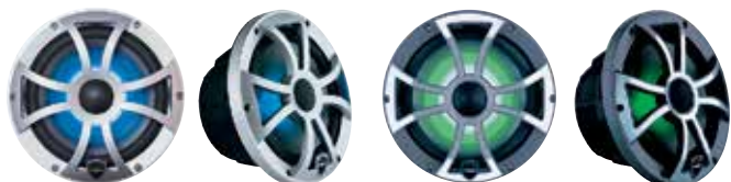
XS-S Silver XS